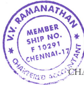
V.V.RAMANATHAN CHARTERED ACCOUNTANT MEMB.NO.F10291